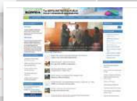
THE KENYA INSTITUTE FOR PUBLIC POLICY RESEARCH AND ANALYSIS