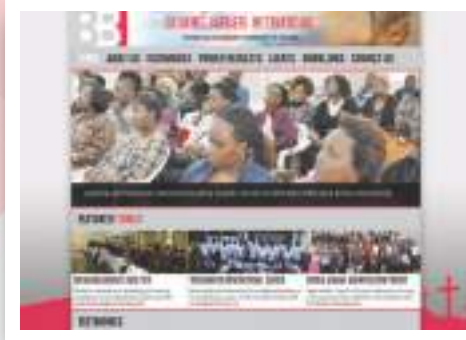
BREAKING BARRIERS INTERNATIONAL