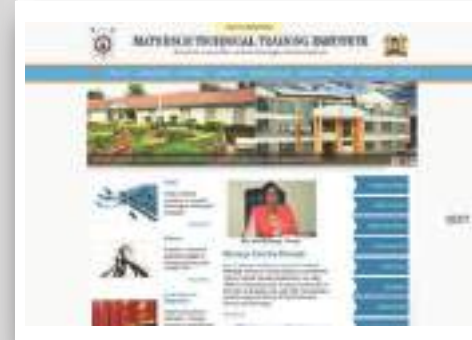
MATHENGE TECHNICAL TRAINING INSTITUTE