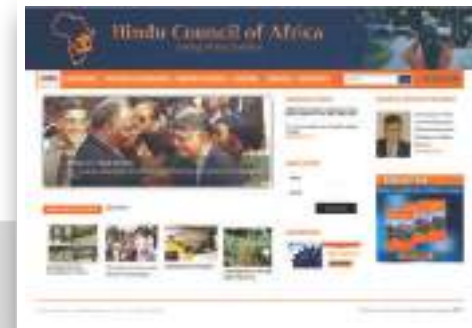
HINDU COUNCIL OF AFRICA