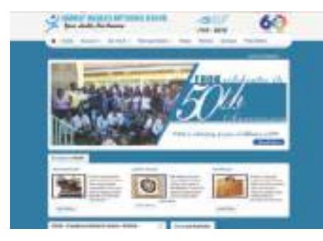
FAMILY HEALTH OPTIONS KENYA