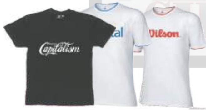
T-SHIRT PRINTING AND EMBROIDERY