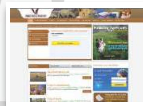
MIGHTY TOURS & TRAVEL LTD