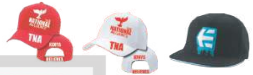
CAP PRINTING AND EMBROIDERY