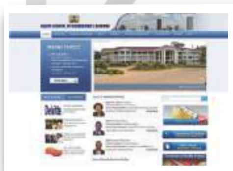
KENYA SCHOOL OF GOVERNMENT