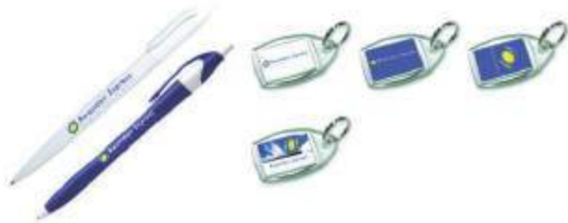
PEN & KEYHOLDER BRANDING