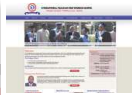
INTERNATIONAL TEACHER AND TRAINING CENTRE